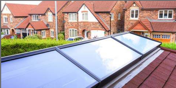
THE UNIQUE SUPALITE VAULTED ORANGERY